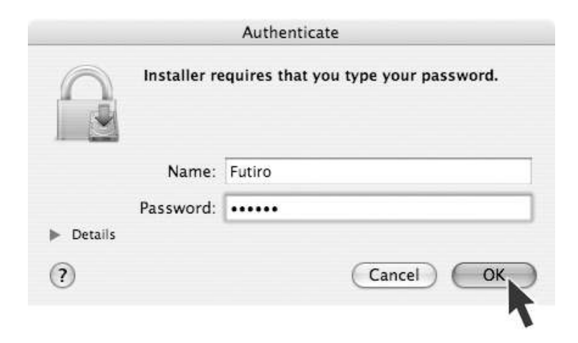
Figure 2.3 – Authentication Prompt

You may be prompted to enter an administrative username and password (Figure 2.3). Enter these details and click OK .